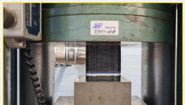
Photo of 80mm shim stack under 143.8kN load

We recommend for shim stacks up to 50mm high the Stacker's compressive strength value should be taken as: 30N/mm 2 (under factored loads).