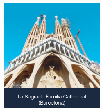
La Sagrada Familia Cathedral (Barcelona)